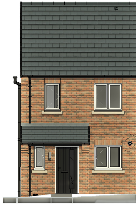
Front Elevation. 1 : 100