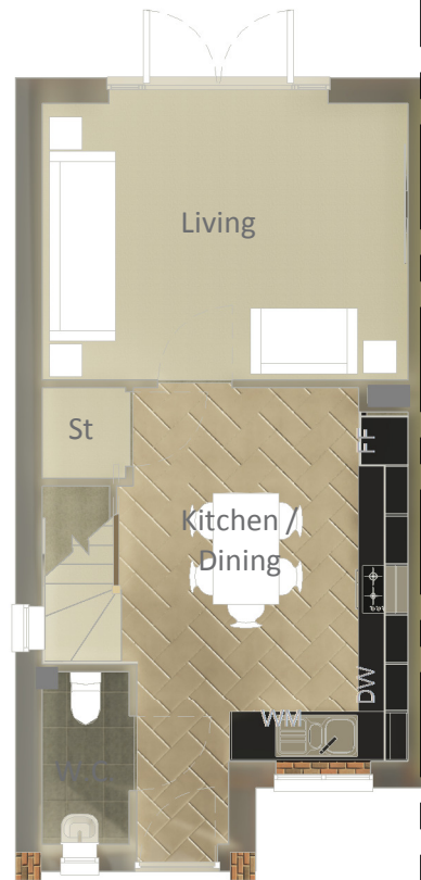
Ground Floor. 1 : 100