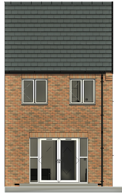
Rear Elevation. 1 : 100