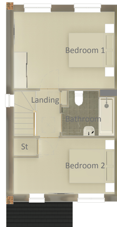
First Floor. 1 : 100